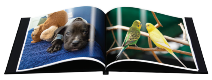
Great for weddings, birthdays, new babies, anniversaries, graduations and class yearbooks, family reunions and vacations.

No equipment is required to make beautiful, professional hard cover photo books! Spiral's patented Pinchbooks™ are reusable, expandable, and use no harmful and messy glues to hold the pages together. Simply pull back the cover and the spring-clamp opens up, insert the pages, and it snaps back together. If the operator makes a mistake, they can simply reopen and adjust the pages so there are never any wasted books or ruined prints! Pinchbooks™ allows your print shop to offer photo books on the spot, for no upfront equipment cost and won't take up precious space in your operation. Custom foil stamping and silk screening options are available.