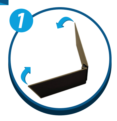
Fold Back Cover