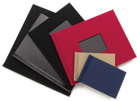
Available in a variety of finishes and colors, with and without window.