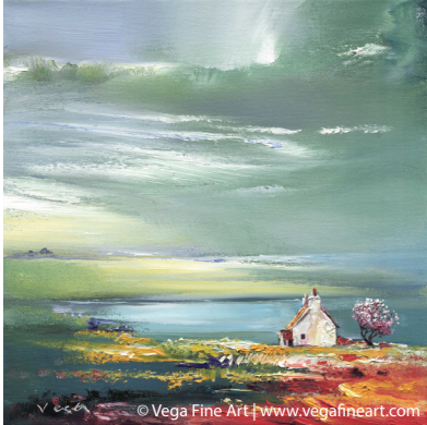
© Vega Fine Art | www.vegafineart.com