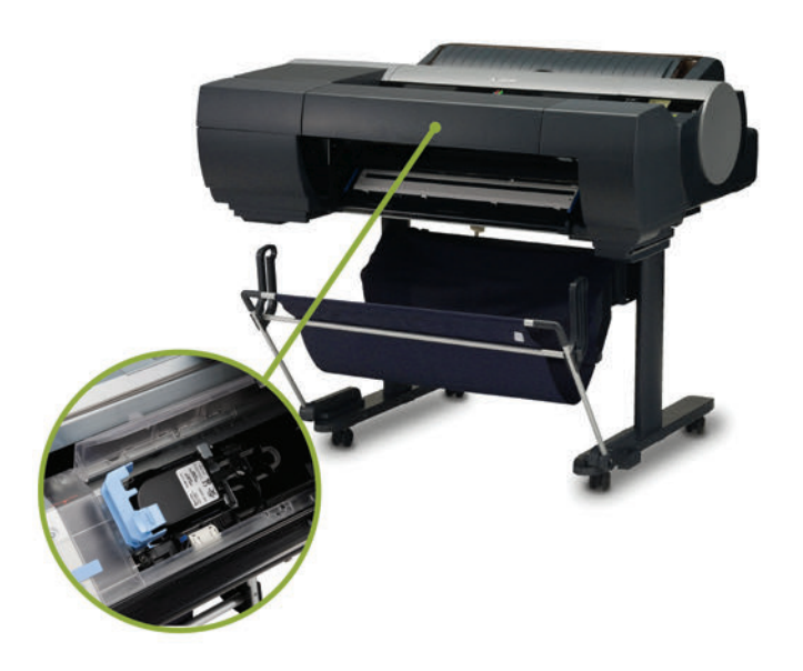
iPF6450 Printer with Optional SU-21 Spectrophotometer

Color Consistency is a device's ability to produce and reproduce colors without a shift or change in tone, hue, or density. An image printed on a device that's producing colors consistently will always look the same any time that image is printed on that device on the same media in the same mode. Canon includes the multi-sensor to help ensure color accuracy and consistency for a single printer when more than one is being used in a printing environment.