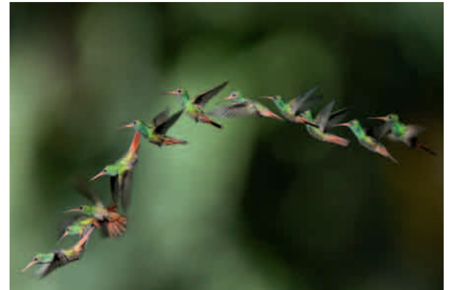
11 images per second at full resolution.

The ultra-fast consecutive burst capability of the Leica V-Lux 2 is more than impressive. With 11 frames per second at the full resolution of 14.1 MP, or 60 frames per second with a resolution of 2.8 MP, the Leica V-Lux 2 is one of the world's fastest consecutive shooting cameras. This means that you won't miss the crucial moment – even when shooting the fastest-moving subjects in the worlds of sport and nature. What's more, the V-Lux 2 can even reveal the details of motion sequences otherwise invisible to the human eye. This is made possible by its newly designed 14.1 MP, CMOS sensor. An integrated electronic Live-View monitor makes the V-Lux 2 perfect for use in bright surroundings, too. It's the perfect travel companion for any situation.