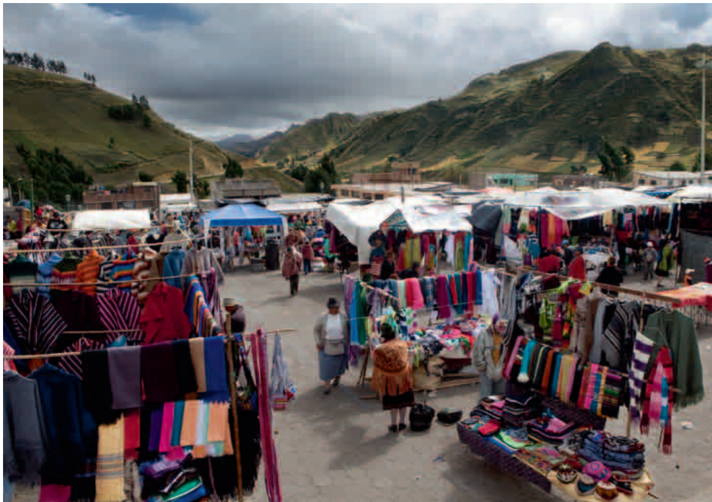
On Saturdays, the beautiful village of Zumbahua comes to life. It is market day. At the stalls, the goods essential to life in the Andes are piled high. Always at hand, the Leica V-Lux 2 captures the vitality of the market from fascinating perspectives. An image taken from overhead reveals the remoteness of the village on the other six days of the week.