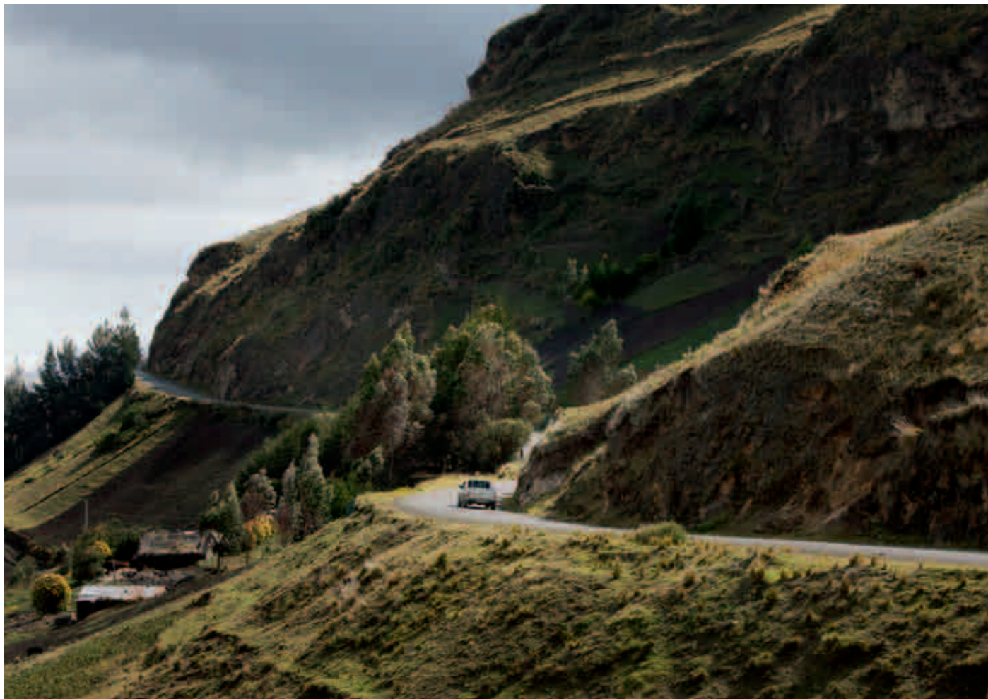
The world's tallest free-standing volcano captivated Humboldt on his journey here 200 years ago. Standing 6,310 meters above sea level, the Chimborazo rises majestically from the Andean mountain range. To the left and right of the road, the local people carry on their daily life. Flocks of sheep are herded along the Panamerican Highway, and at roadside stalls, smiling indigenous Ecuadorians sell grilled bananas.