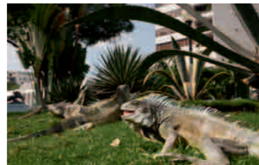
Taken from ground level.