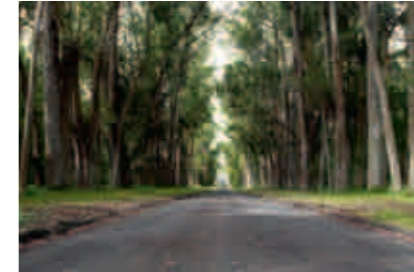
Taken at an equivalent focal length of 25 mm.