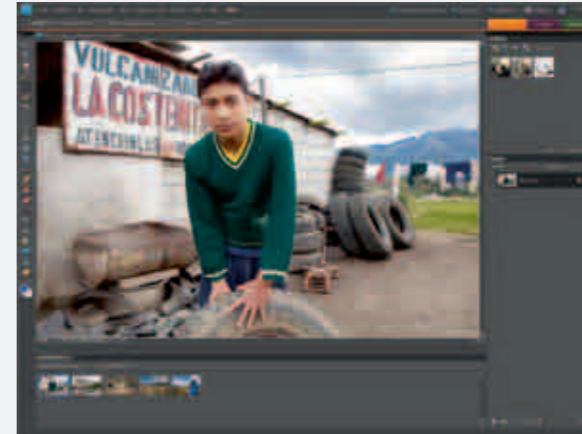
ADOBE® PHOTOSHOP® ELEMENTS 8

The V-Lux 2 package includes the powerful image processing software Adobe® Photoshop® Elements 8. This amazingly versatile and easy-to-use full-image-processing solution lets you view, organize, archive, and process both photos and videos. A wide range of options enables intuitive image processing of both compressed and RAW image data files. And the convenient Before and After feature lets you compare your processing results with the original image at any time.