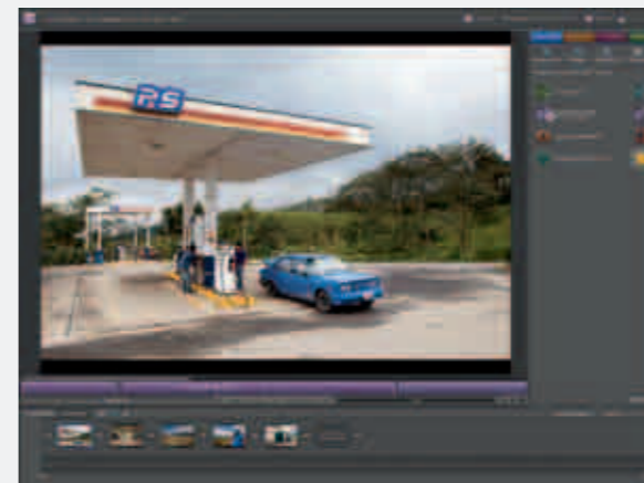
ADOBE® PREMIERE® ELEMENTS 8

The V-Lux 2 package includes the powerful image processing software Adobe® Photoshop® Elements 8. This amazingly versatile and easy-to-use full-image-processing solution lets you view, organize, archive, and process both photos and videos. A wide range of options enables intuitive image processing of both compressed and RAW image data files. And the convenient Before and After feature lets you compare your processing results with the original image at any time.