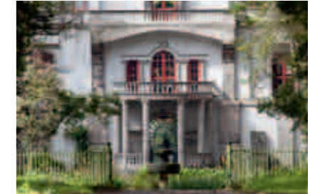
Taken at an equivalent focal length of 600 mm.

Just like every other Leica lens, the Leica DC Vario-Elmarit 1:2.8-5.2/4.5-108 mm ASPH. on the V-Lux 2 is a true optical masterpiece. The equivalent focal lengths of this 24x super zoom for photo and video range from a super-wide-angle 25 mm to an extreme telephoto of 600 mm. This makes the Leica V-Lux 2 a true all-round genius – and the perfect camera for any situation. Its super-zoom lens ensures tack-sharp pictures, whether finely detailed macro close-ups, breathtaking wide-angle vistas, or super-telephoto shots. It is the ideal camera for travel and nature photography. Thanks to its enormous zoom range, the V-Lux 2 opens up almost infinite photographic opportunities without any need to change a lens, and makes it an attractive alternative to comparable SLR systems with interchangeable lenses.