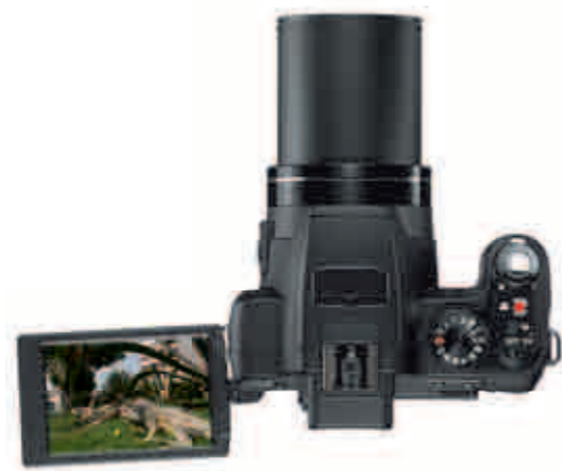
Tilts 180° horizontally and 270° vertically.