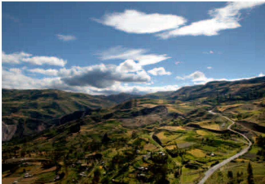
Guayaquil: 444 numbered steps lead through a vibrantly creative neighborhood up to Santa Ana. Alausi is the starting point for one of the most hair-raising train rides in the world – a series of razor-sharp switchbacks into the valley and back again. In stark contrast, the view of the Panamerican Highway winding toward Chimborazo is perfectly serene.

Ecuador is one of the most diverse nations on Earth. Nowhere else can the traveler discover such a wide variety of landscapes, animals and plants, immaculate, palm-lined beaches, desolate volcanic mountain ranges, and ancient rainforests rich with wildlife. Alexander von Humboldt was immediately fascinated upon his arrival in this country in 1802 and during his expedition through South America. Internationally acclaimed during his own lifetime as a leading naturalist, Humboldt observed that the one geographical constant here is diversity. Even 200 years later, this truth remains unchanged. To the delight of globetrotters and adventurers, the remarkable variety and beauty of Ecuador is preserved to this day. And any travelers in this country will find themselves crossing paths with Humboldt's journeys of two centuries ago. Naturally, today's travelers will find it slightly easier to traverse the dramatically mountainous terrain of Ecuador than the indefatigable Humboldt did. But then as now, the fantastic view from the top of the Chimborazo volcano ensures that all exertions are quickly forgotten.