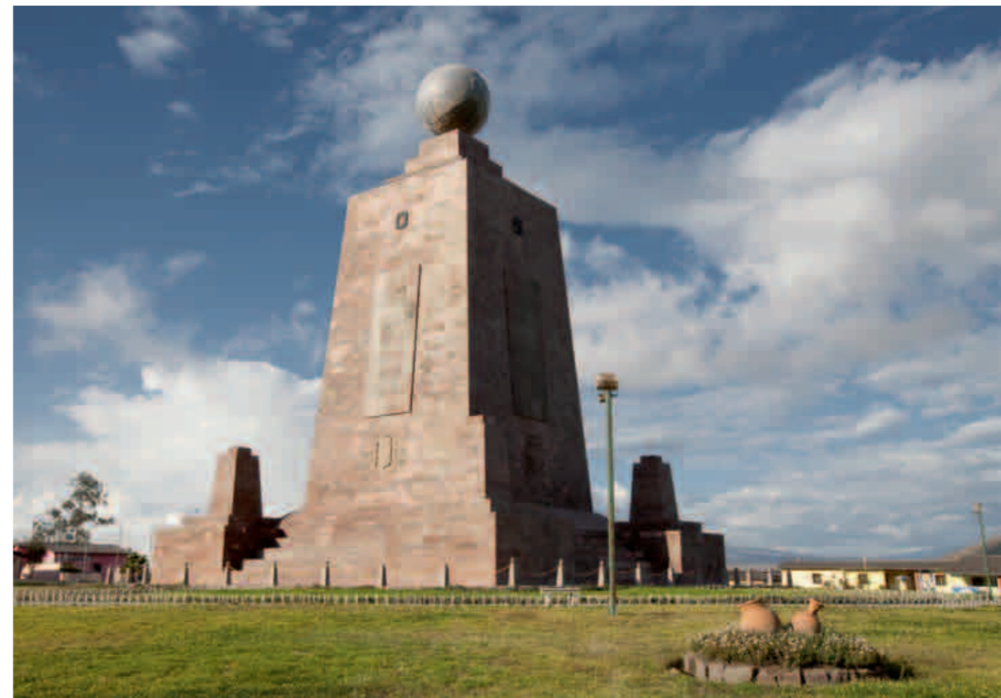
One thousand years ago, the Incas determined the exact position of the equator. In 1736, French explorers established it anew – and were off by 240 meters!