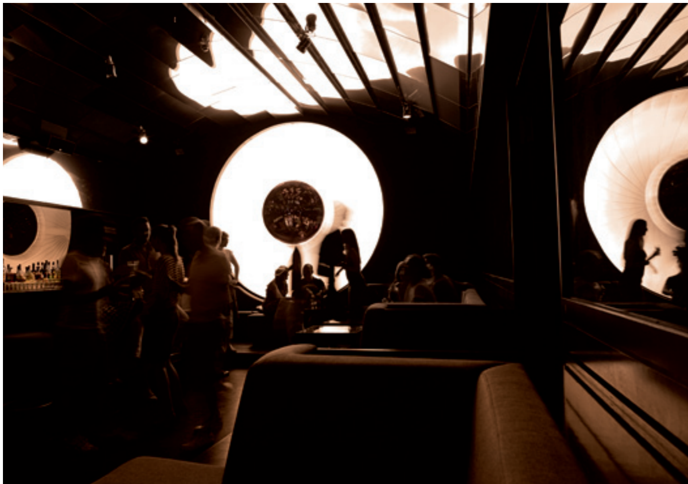
Berlin, New York, London, Tokyo! With its funky interior in 1980s nightclub style, Bar Tausend is the epitome of the international party lifestyle. The light installation at the far side of the room, "Das Auge" (The Eye), is by the Berlin lighting designer Schneider-Moll, and was once featured in the Louis Vuitton showroom in Paris.

Leica A trademark of the Leica Camera Group "Leica" and product names = ® registered trademarks © 2010 Leica Camera AG HDMI, the HDMI logo, and High-Definition Multimedia Interface are trademarks or registered trademarks of HDMI Licensing LLC. We reserve the right to make changes in construction, features, and offers without advance notice. Concept and design: argonauten G2, Frankfurt Brochure order no.: German 91 538 / English 91 539 / French 91 540 / Japanese 91 541 / Chinese (simplified) 91 548, (09/2010) Leica Camera AG / Oskar-Barnack-Strasse 11 / 35606 SOLMS / GERMANY Phone +49(0)6442-208-0 / Fax +49(0)6442-208-333 / www.leica-camera.com