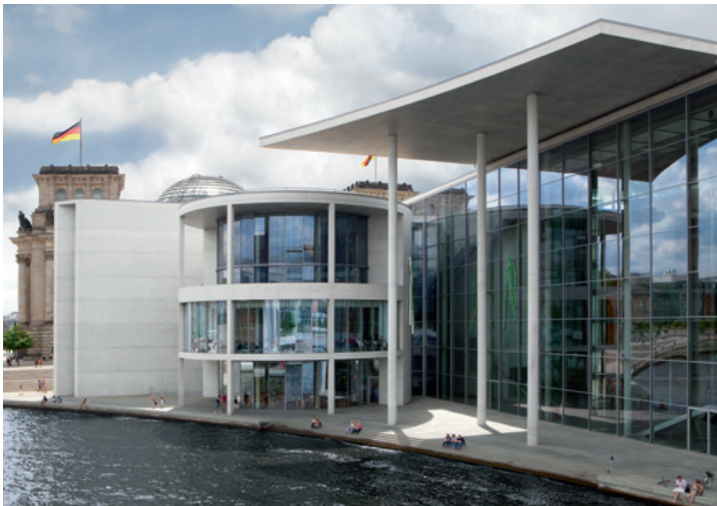
Only in Berlin can you find deck chairs and a beach atmosphere in the heart of the government quarter.

Berlin is unique in many ways, and with the fall of the wall it became the site of a great architectural experiment, unmatched in any contemporary European city. Foremost among these extraordinary projects are Potsdamer Platz and the new government district, extending to the north of the Reichstag. The master plan by Berlin architects Schultes Frank Architekten is acknowledged as a work of genius. And even that has tradition in Berlin: the New National Gallery, located not far from the government district, was created by one-time Bauhaus director Mies van der Rohe from 1965 to 1968 and is today considered an icon of classic modernism.